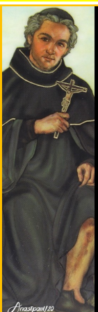
PRAYER TO ST PEREGRINE FOR HIS INTERCESSION

ST PEREGRINE WE COME TO YOU CONFIDENTLY TO IMPLORE YOUR AID WITH GOD IN OUR NECESSITY. YOU WERE CONVERTED FROM A WORLDLY LIFE BY THE GOOD EXAMPLE OF ONE HOLY PERSON. YOU WERE CURED, INSTANTANEOUSLY OF CANCER, BY GOD’S GRACE AND YOUR UNCEASING PRAYER. IN YOUR GRACIOUS KINDNESS, PLEASE ASK THE LORD TO HEAL US ALSO IN BODY, MIND AND SOUL. MAY WE THEN IMITATE YOU IN DOING HIS WORK WITH RENEWED VIGOUR AND STRENGTH. AMEN