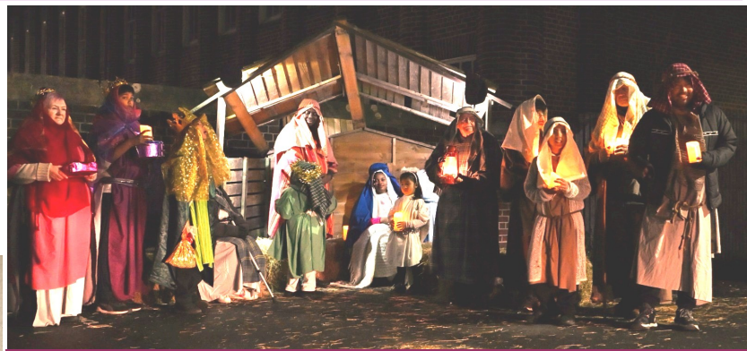
St Mary's stable for Lochee Christmas Light Night