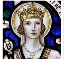
St Margaret of Scotland

Dates for your calendar: Parish Council Meeting , Thurs 21st at 7pm in Church House.