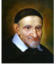
St Vincent De Paul