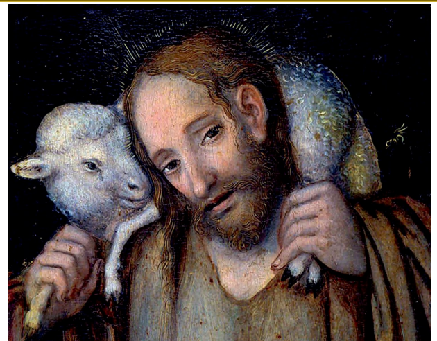
"The Good Shepherd," a painting by the German Renaissance artist Lucas Cranach der Ältere

This is Good Shepherd Sunday during which we pray for vocations to the priesthood, diaconate and the Religious Life.